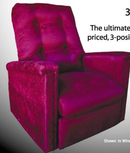
Shown In Wine

The ultimate in value. An economy priced, 3-position lift & recline chair, with a knock-down back. Built on a solid wood frame with our best quality lift-mechanism and motor, the only thing economical about this chair is the price.