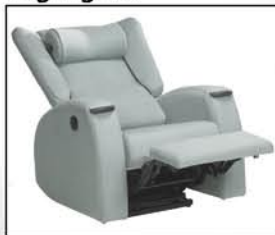
"Wall-Hugger" design and full recline