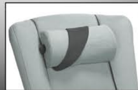
Reversible-Removable Headrest cover