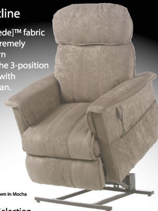
Shown in Mocha

Luxurious Nex[Suede]™ fabric highlights this extremely supportive, modern interpretation of the 3-position lift & recline chair with continuous ottoman. Cushions made of only the highest quality foam.