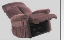
Shown in Cotton Candy