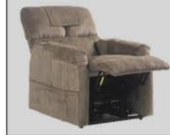
Shown in Mallard