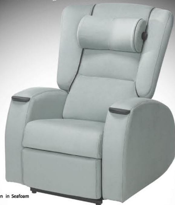
Shown in Seafoam