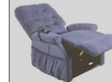
Shown in Deep Blue