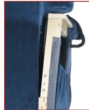
501 M shown