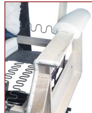
501 M shown

Each luxury lift & recline chair is hand crafted in our facility using decades of motion furniture experience.