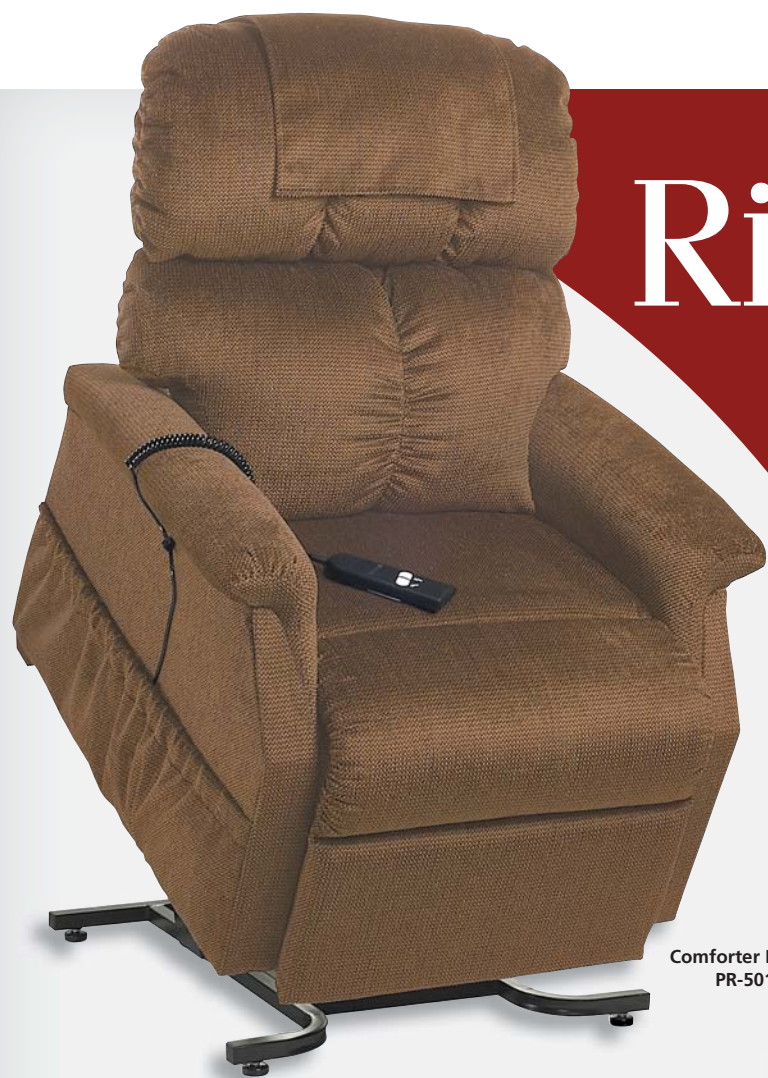
Comforter Medium PR-501M