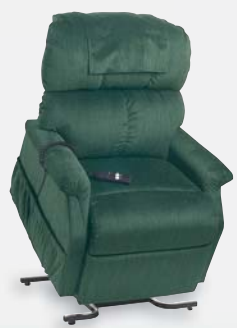
Comforter Large PR-501L