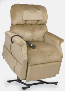
Comforter Small PR-501S