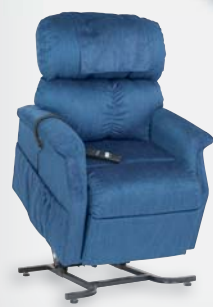
Comforter Junior Petite PR-501JP